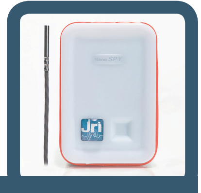
Non contractual photo

Mini Extreme Temperature Data logger 2,4GHz radiofrequency communication